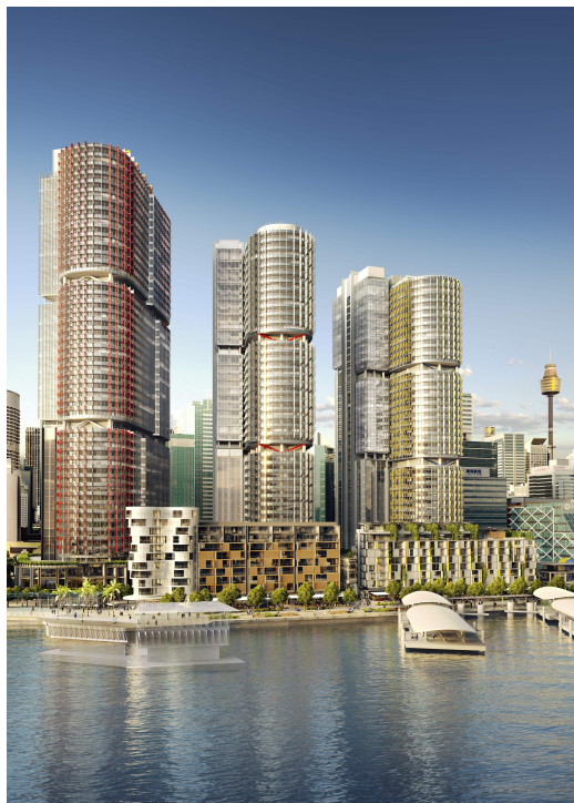
Artist impression only, as at May 2014